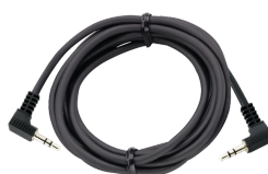
52110051 Jack cable