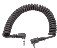
52110052 Spiral cable