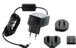
52110056 Mains adaptor