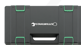
81271013 Socket set