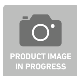
83826781 Insert for torque spanner set