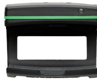
52110220 Bluetooth modules for torque wrench