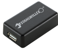
52110061 Interface adaptor