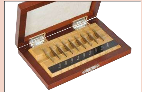
Steel 9-block set.