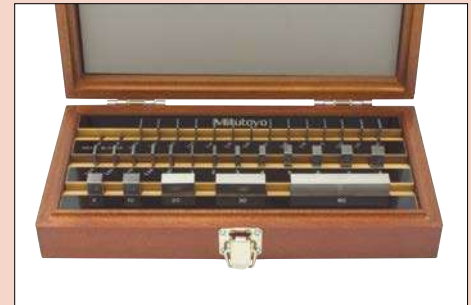
Steel 32-block set.