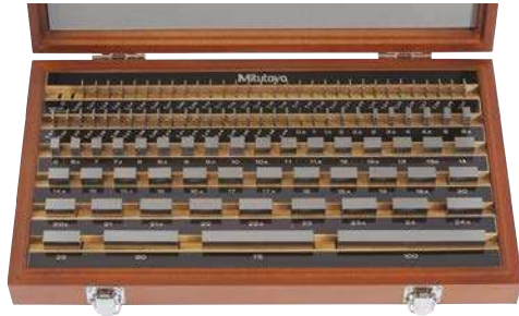
Steel 103-block set