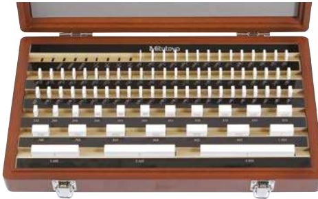
CERA 81-block set