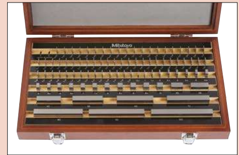
Steel 88-block set.